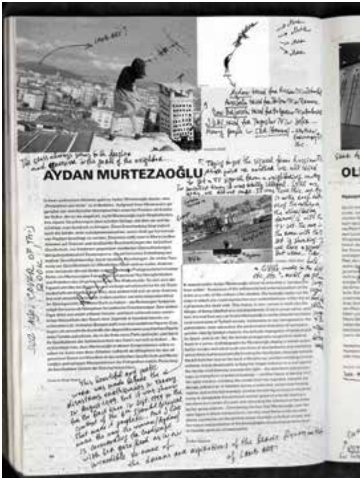
Škodoželjna vodstva, 2003 detajl: Knjiga – razstveni katalog, predelan v knjigo umetnika. Prednja platnica