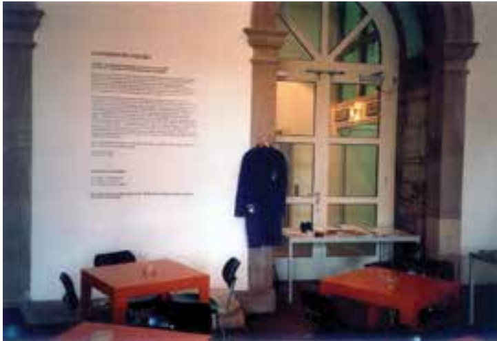
Lučezar Boyadjiev Schadenfreude Guided Tours , 2003 Detail: the guide's corner in the reception area of the Kunsthalle Fridericianum during his off-hours