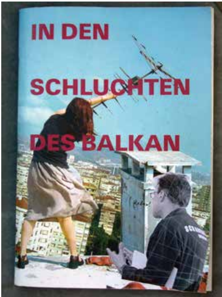
Lucezar Boyadjiev Schadenfreude Guided Tours, 2003 Detail: The Book – the catalogue of the show transformed into an artist's book. Front cover