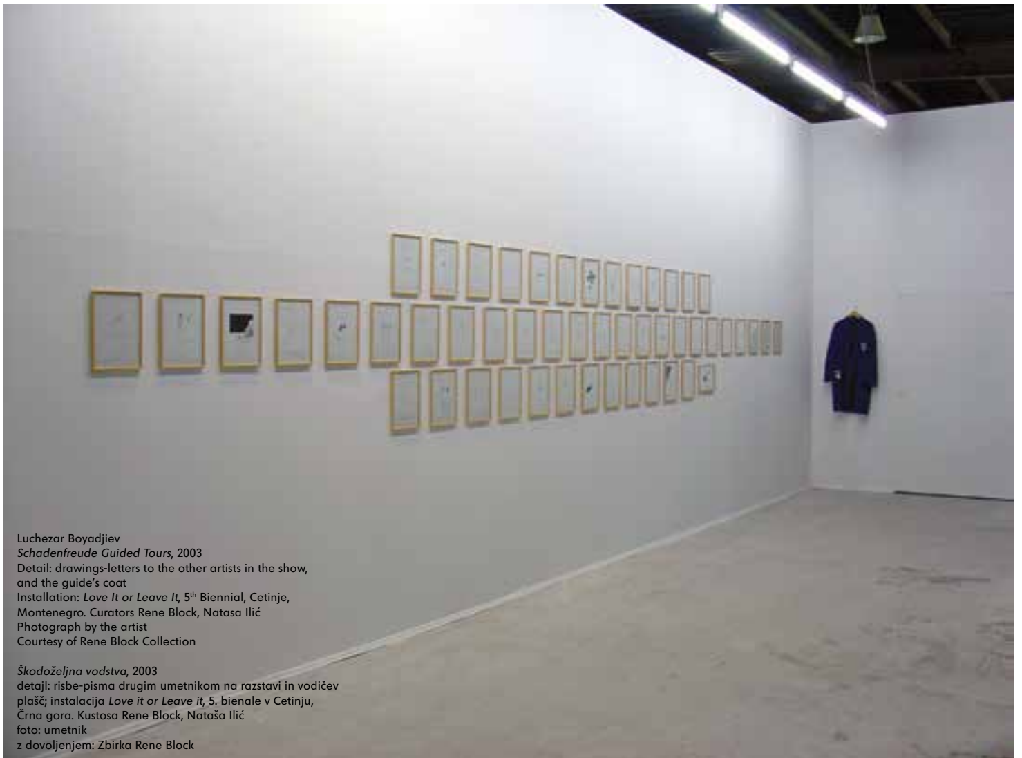
Lučezar Boyadjiev Schadenfreude Guided Tours , 2003 Detail: drawings-letters to the other artists in the show, and the guide's coat Installation: Love It or Leave It , 5 th Biennial, Cetinje, Montenegro. Curators Rene Block, Natasa Ilić