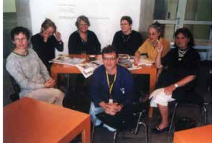
Škodoželjna vodstva , 2003 detajl: umetnik poučuje siceršnje vodiče v Kunsthalle Fridericianum foto: Dan Perjovski Z dovoljenjem umetnika